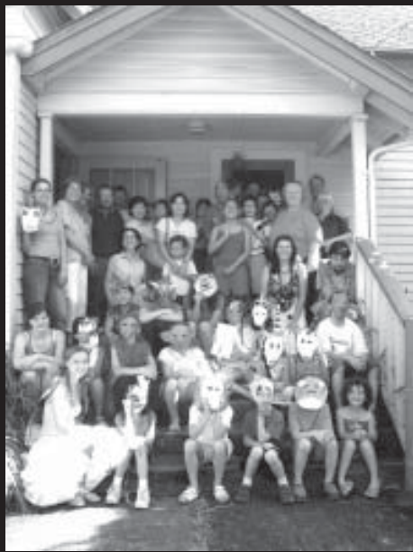
2004 "Mythical Creatures" Summer Campers